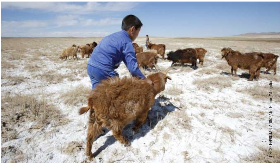
Bayarkhuu, 11 years old, is often sent out to look after the goats or sheep quite a long distance from his home. It is very common in Mongolia for boys to miss school for this reason.

In this region, both girls and boys face obstacles in their participation in school, underlining the fact that promoting gender equality is not just about women and girls, but men and boys as well. While gains have been made towards universal primary education and many countries have achieved or are close to achieving gender parity in primary school enrolment, gender parity has not yet been reached at the secondary education level, with boys at the disadvantage in some cases. Of the 31 countries for which data were available, 14 had lower proportions of boys enrolled in secondary education than girls in 2005, including Fiji, Malaysia, Mongolia, Thailand, the Philippines, Samoa and Tonga. One reason for this is that boys are often co-opted to work full-time to earn money, putting an end to their formal learning. In Mongolia, for example, boys drop out of school to contribute to household incomes by working with livestock. Male child labour in this case is very much influenced by poverty. At the tertiary education level, there is a growing trend of higher rates of girls' enrolment, and a 'reverse' gender gap.