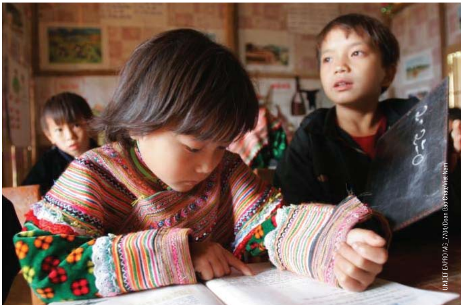
An ethnic minority girl at Hoang Thu Pho primary school, Bac Ha District, Lao Cai Province, Viet Nam

National aggregate figures for gender parity may not fully reflect local realities and often mask disparities at the sub-national level, with pockets of unreached children, mostly girls, from ethnic minorities, migrant families, or among those who are displaced by conflict or natural disasters, who are poor, who are child labourers, who live in remote areas, or have disabilities. The barriers to education based on gender biases may be compounded by these factors. These children are often also vulnerable to various forms of social exploitation and denied their right to education.