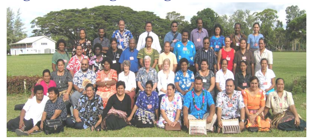
Participants at the "Rethinking the teaching and learning of literacy and numeracy in the Pacific Workshop"

Papers and presentation from the workshops will be published in our Pacific Education Series, No 5 due out early next year.