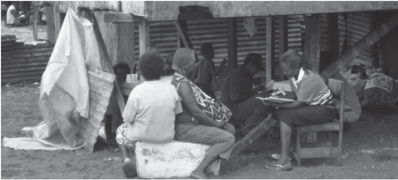
Education Watch surveyor interviewing a mother at Mamanawata settlement

The results of the survey will hopefully shake the complacency with which successive governments have viewed the issue of literacy in the community. Many have known that the official literacy rates are unreliable and yet these are still cited in official publications. The official figures are grossly misleading and should no longer be used as a basis for policy-making.