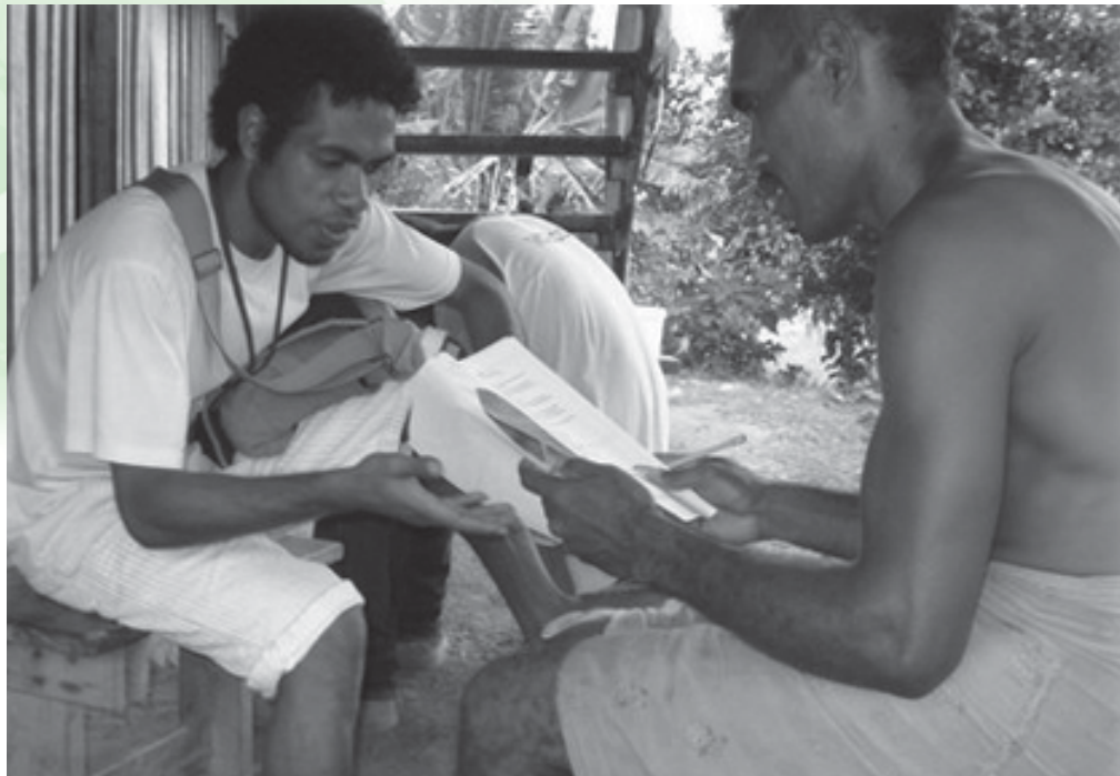
Education Watch surveyor interviewing respondent at Gilbert Camp settlement in Honiara

can be tracked over time. There is potential also for the survey to be adapted to examine a wide range of educational issues in greater detail.