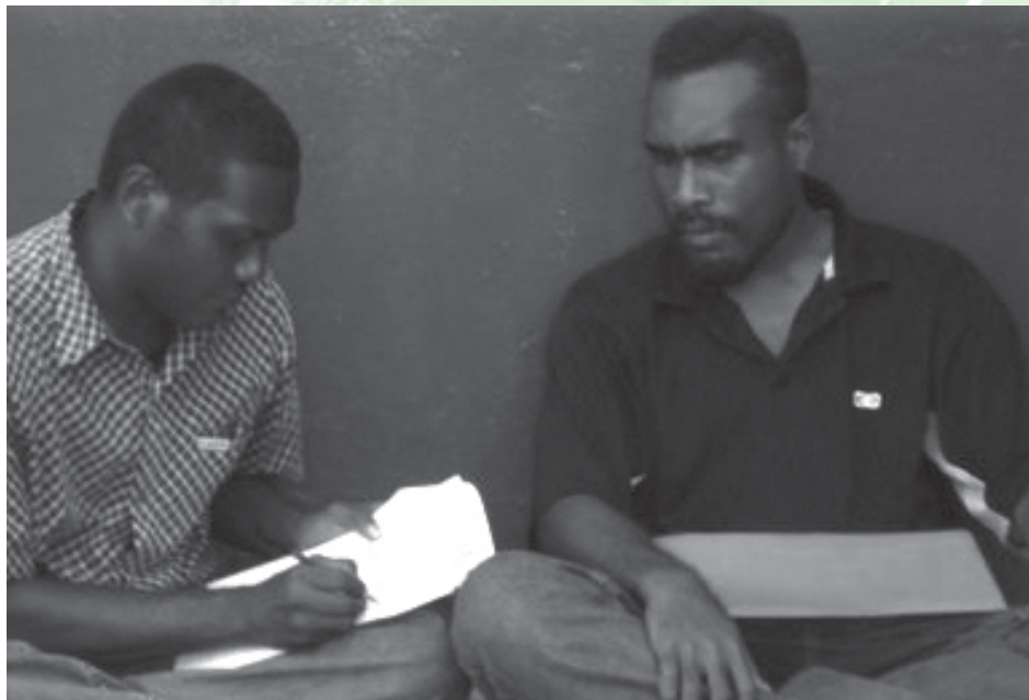
Education Watch Surveyors' Training Workshop in Honiara

While most people grow up with langus as their first language, langus are not used as languages of instruction in schools. A number of other countries, including Papua New Guinea, have judged that there are learning and cultural advantages in using vernacular instruction in the early years of schooling. This issue deserves serious study in the Solomon Islands. It may be one way of engaging more students in formal education and giving them a head start into future learning at school.